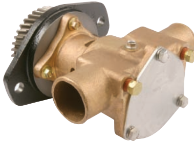
P1716X, P1722X, & P173