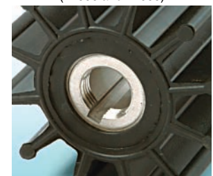
Threaded Thru-Key Design Impellers (17000A)