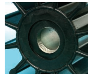
Threaded Impellers (17000 and 27000)