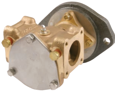
P1710X, P1710A, P1726X, P1732X & P1732A