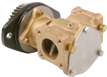
P1727X, P1727A, P1730X, P1730A, P1731, and P1733X