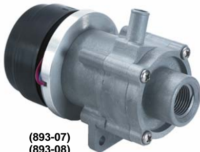
(893-07) (893-08) NON-SUBMERSIBLE