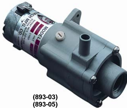
(893-03) (893-05) NON-SUBMERSIBLE