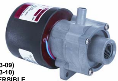
(893-09) (893-10) SUBMERSIBLE OR OPEN AIR

12 V.D.C. + 2 Volts, - 5 Volts 24 V.D.C. + 4 Volts, - 12 Volts The Red Lead is Positive. The Blue Lead is Negative.