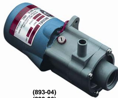
(893-04) (893-06) SUBMERSIBLE