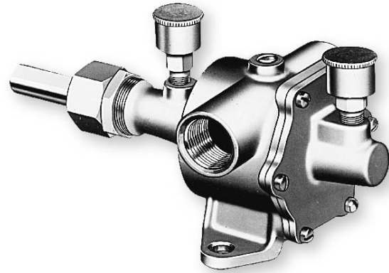
Model 4560-Series, 4590-Series, 4620-Series

Other JABSCO models are also available in bronze, plastic and stainless steel. JABSCO Pureflo® pumps are also available for sanitary applications.