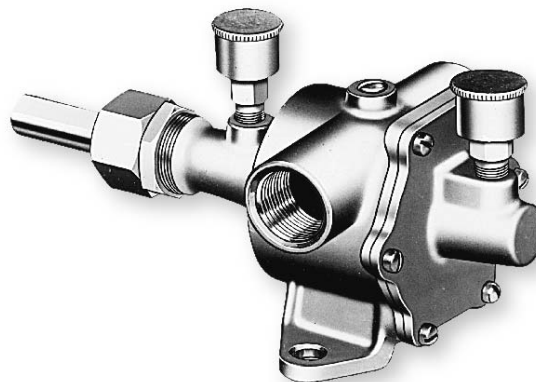
Model 4560-Series, 4590-Series, 4620-Series

Other JABSCO models are also available in bronze, plastic and stainless steel. JABSCO Pureflo® pumps are also available for sanitary applications.